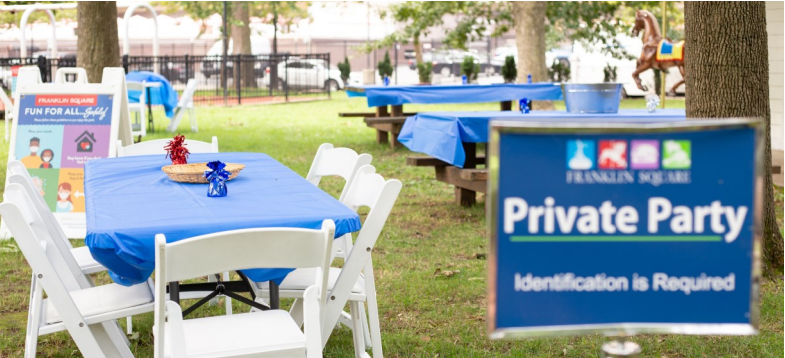
Additional fees may apply based on custom requests and extensive set-up in surrounding lawn spaces. Discounted rates available for 501c3 nonprofits. | All event rentals occur rain or shine.