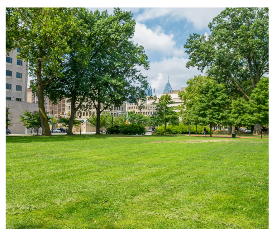
Additional fees may apply based on custom requests and extensive set-up. Discounted rates available for 501c3 nonprofits. | All event rentals occur rain or shine.